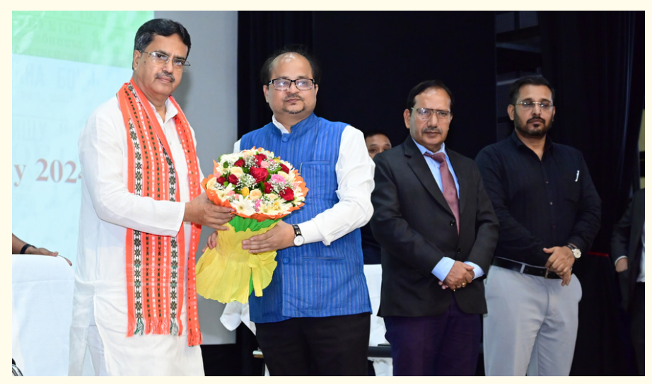
Visit of Honourable Chief Minister of Tripura