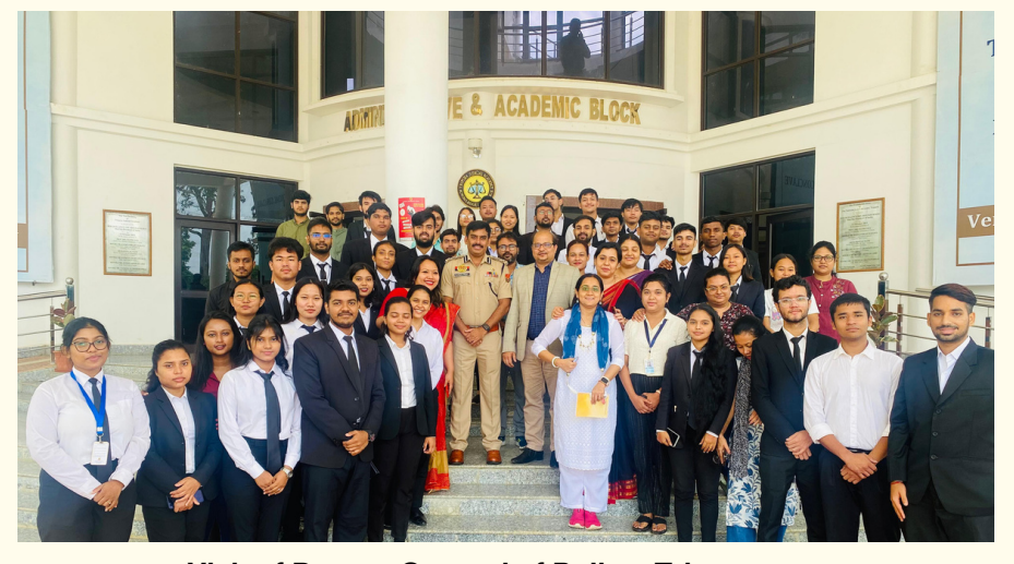
Visit of Deputy General of Police, Tripura