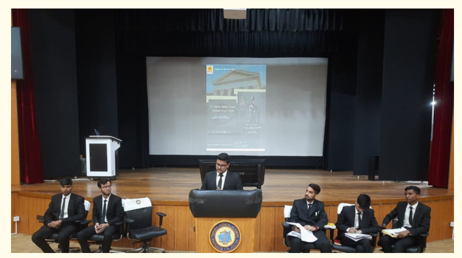
Intra-University Moot Court Competition