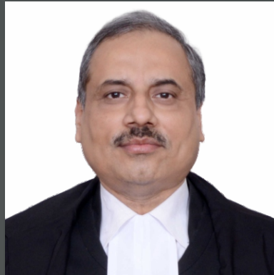
Hon'ble Mr. Justice Ramesh Sinha Chief Justice of High Court of Chhattisgarh & Hon'ble Chancellor, HNLU