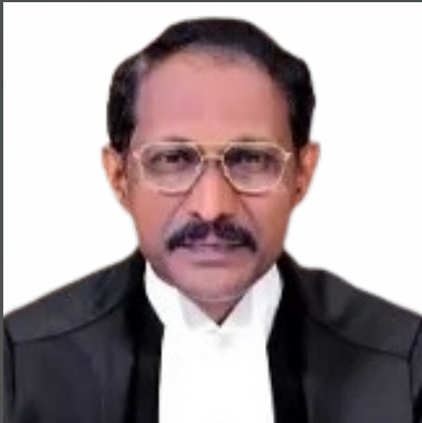
Hon'ble Mr. Justice CT Ravikumar Judge, Supreme Court of India & Hon'ble Visitor, HNLU